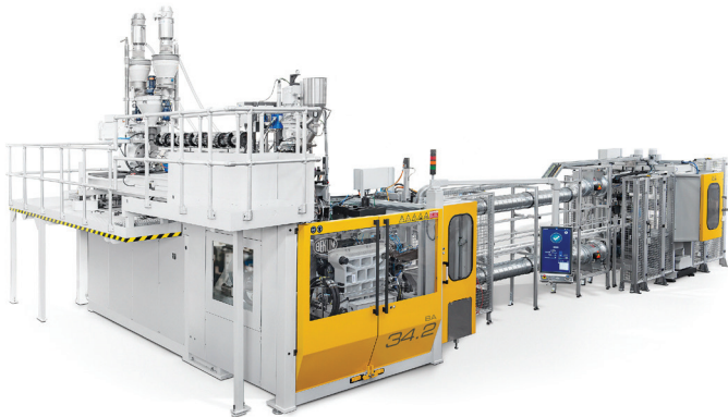
BA-34.2 High Speed Continuous Extrusion High Speed