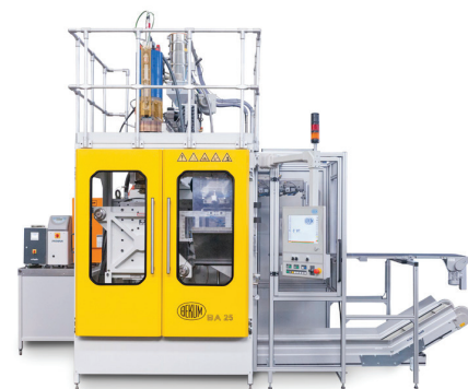
BA-25 Accumulator Head