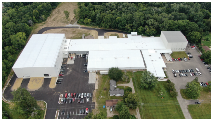
The EBLOW 407D is Proudly Manufactured in Williamston, MI USA

Bekum America Corporation 1140 West Grand River Avenue Williamston, Michigan 48895 USA