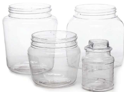
Non-handled, wide-mouth jars of various sizes and shapes are being commercialized with DAK's Array EBM resins.