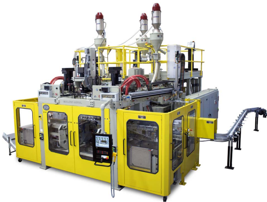
EBLOW 407 DL

With the EBLOW 407 DL we are putting a system at the centre of our appearance at the NPE 2018, which offers an excellent price-performance ratio in the high-speed production of consumer packaging.