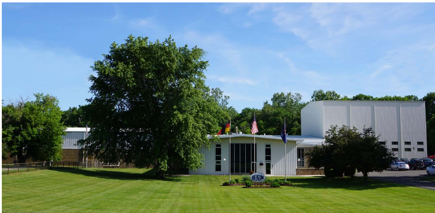
BEKUM America Corporation, Williamston/Michigan USA