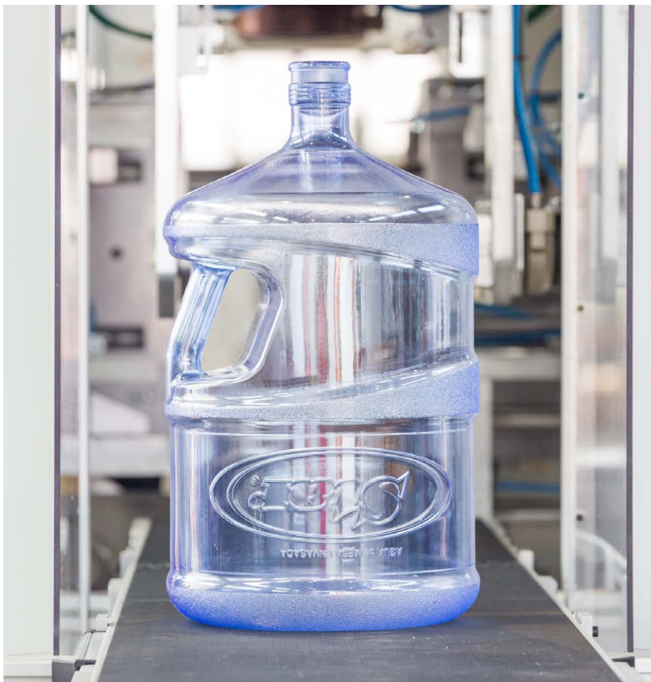
PC-water bottle with handle